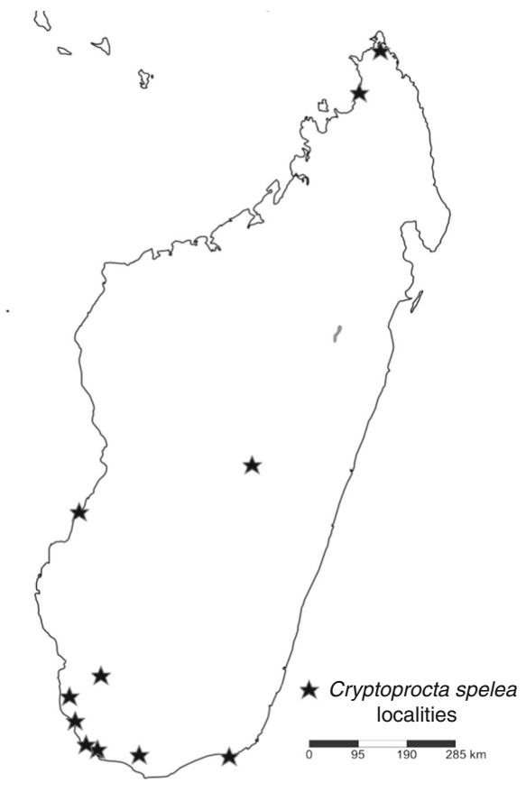
Fig. 3 Map showing the geographic distribution of Cryptoprocta spelea

reports (e.g., Lamberton 1939; Goodman et al. 2004) that skull length is approximately 20% greater in C. spelea (152.7 mm) than C. ferox (125.2 mm). The differences in maxillary and mandibular bicanine distances (tip to tip) are closer to 15%. Our means for maxillary intercanine distance (tip to tip) are 28.8 mm for C. spelea and 25.3 mm for C. ferox .