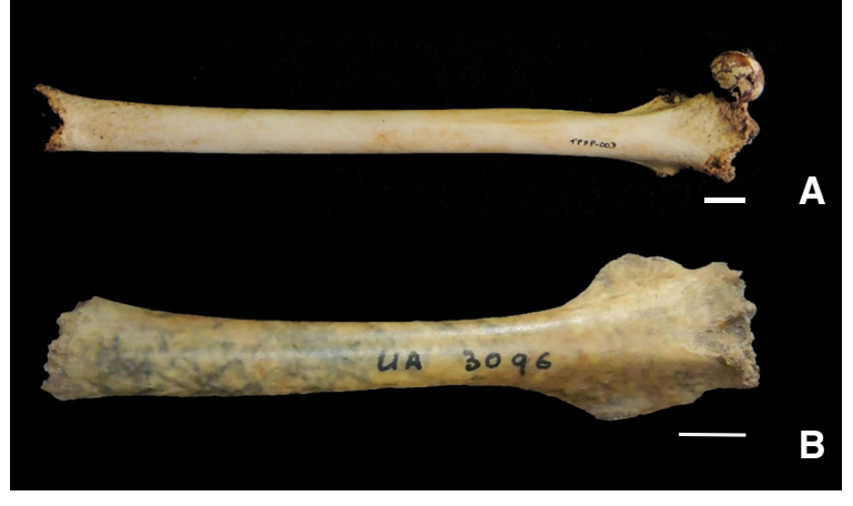
Fig. 2 Comparison of femur of recent Propithecus diadema (TFFP-003) from Tsinjoarivo (A) damaged by Cryptoprocta ferox and femur of subfossil Pachylemur insignis (UA 3096) from Tsirave (B) with Crypoprocta damage. Note the damage to the proximal and distal ends of the bone,

reports (e.g., Lamberton 1939; Goodman et al. 2004) that skull length is approximately 20% greater in C. spelea (152.7 mm) than C. ferox (125.2 mm). The differences in maxillary and mandibular bicanine distances (tip to tip) are closer to 15%. Our means for maxillary intercanine distance (tip to tip) are 28.8 mm for C. spelea and 25.3 mm for C. ferox .